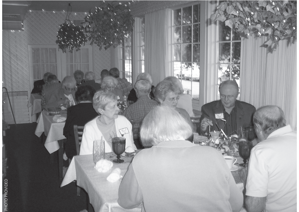
PURA members enjoy conversation and a family-style meal at the Iron Skillet in Indianapolis.

Refreshments and T-shirts were shared from the Cancer Challenge 5K run/walk recently held in the community. Donations are always appreciated to fund cancer research and to purchase newer and better equipment. Retirees appreciated the hospitality and sharing of information. The research is ongoing and is part of the worldwide research that offers hope and insight into the disease of cancer.